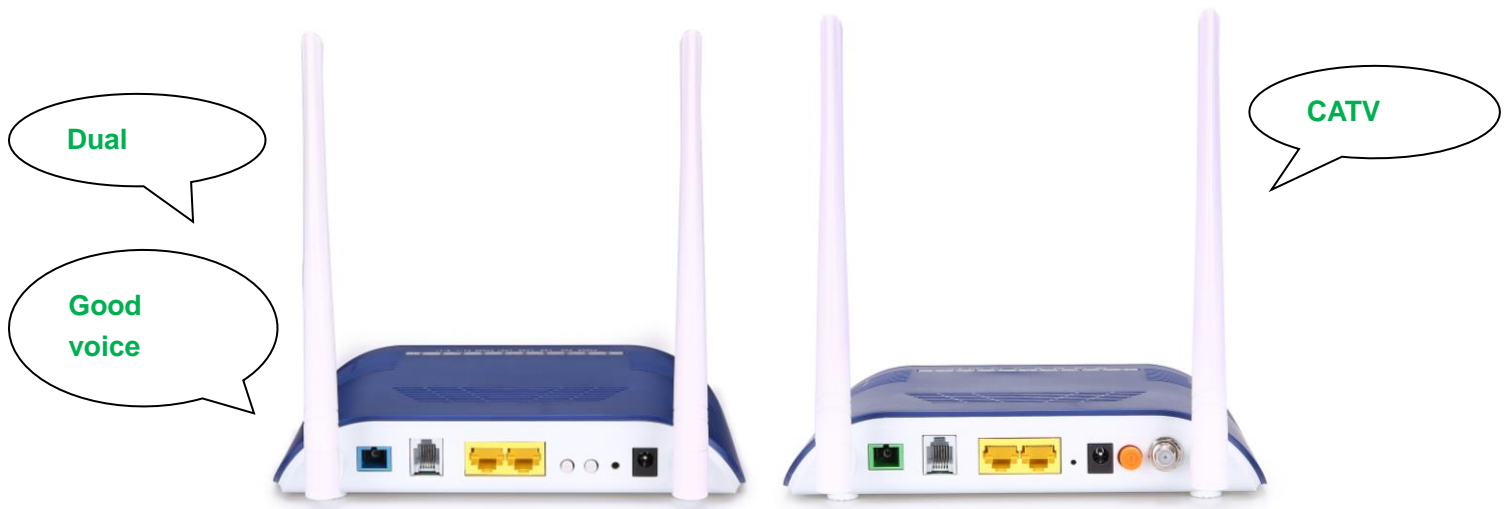
Figure 1 1GE+1FE+1POTS+wifi

G/EPON 1GE+1FE+WiFi+CATV ONU meets telecom operators FTTO (office), FTTD (Desk) ,FTTH(Home) broadband speed, SOHO broadband access, video surveillance and other requirements to design an EPON/GPON Gigabit Ethernet products. It is based on mature and stable, cost-effective EPON/GPON technology, high reliability, easy management, configuration flexibility and good quality of service (QoS) guarantees to meet the technical performance of IEEE802.3ah and ITU-TG.984.x , China Telecom EPON/GPON equipment technical requirements and other specifications.